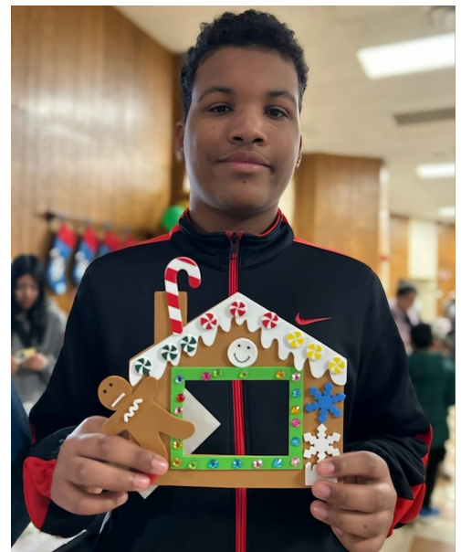
Pictured at top and above: A total of 196 children and their families attended DLM's annual Breakfast with Santa which was held Saturday, December 14 in the Fellowship Hall at Holy Trinity Lutheran Church.

One such event was DLM's annual Breakfast with Santa held December 14. This year, a total of 196 children and their families attended! To help make this event happen there were more than 50 volunteers! A full breakfast buffet was prepared and served to everyone. There were seven craft stations for children to enjoy, face painting and a beautifully decorated photo stations where families could take selfies. And, of course, there was Santa Claus! Santa brought special gifts for all the children. It was nice watching families having a great time together in a safe and peaceful atmosphere. Thank you to everyone who helped make this a magical event! †